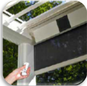
Remote control operation