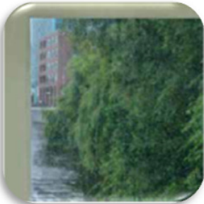
Crystal blind screen