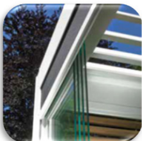
Combination side walls