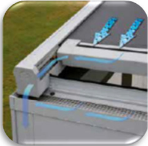
Integrated water drainage