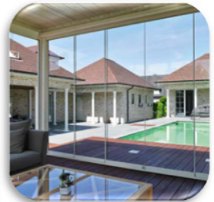
Sliding glass walls