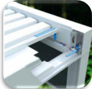
Integrated water drainage