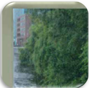
Crystal blind screen