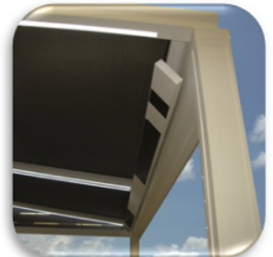
Heat and sound bar