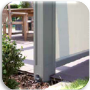
Integrated water drainage