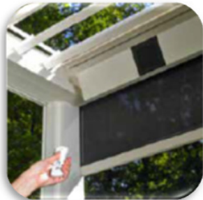
Remote control operation